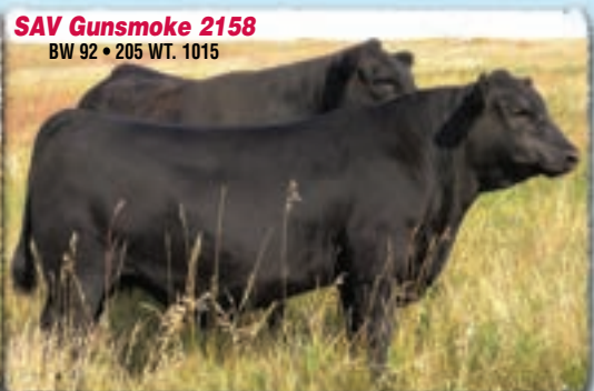
He sells! A powerful representation of the first calfcrop by the $185,000 SAV Jesse James 0968. His Pathfinder dam by Resource records a weaning ratio of 105 on 7 calves and is the #1 ribeye female in the SAV herd.