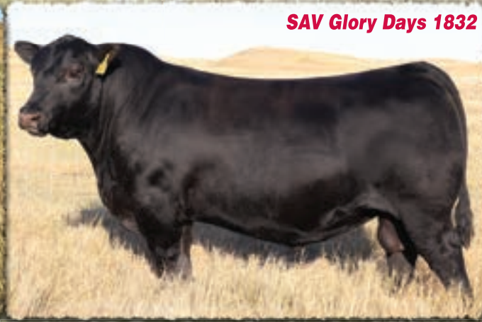
A real stock bull with muscle, capacity and soundness in high performance fashion. He is the product of the predictable mating of America to the proven Pathfinder, SAV Madame Pride 3145, and was selected by Vermilion Ranches as the $82,500 featured lot 1 bull from the 2022 SAV Sale. Full and maternal siblings sell.