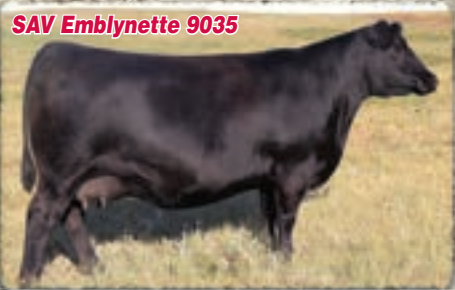
A tremendous 3-year old daughter of 316 x Resource x Right Time. She is moderate-framed and efficient with a beautiful udder and perfect feet. She comes from four generations of SAV embryo donors. Her America son is featured.