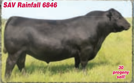
The $350,000 top-selling bull from the 2022 SAV Sale to Voss Angus.

This highly respected, industry-proven sire is a breed-leader for annual registrations and legendary headliner at Select Sires Al Stud. His daughters rise to the top of many herds and his sons include Downpour, Bloodline, Grand Canyon and Riptide. 30 progeny sell.