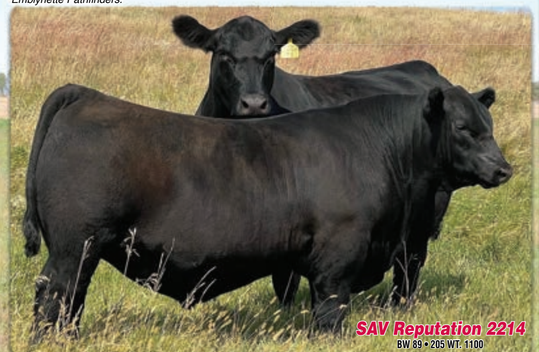
He sells! This performance headliner by Renovation takes all honors as the heaviest 205-day weight bull of his entire calfcrop at 1100 lbs. for a weaning ratio of 118. His perfect-uddered 3-year-old dam by President is on a productive path. His Harvestor x Bismarck Pathfinder grandam, SAV Madame Pride 3045, has eleven direct progeny selling