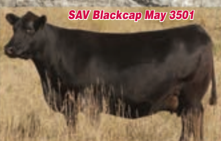
A phenomenal full sister to Resource and Renown with the maternal design and production record to walk with the best in the breed. She records a weaning ratio of 105 on 8 calves and has multiple progeny selling by Bloodline and Encore.