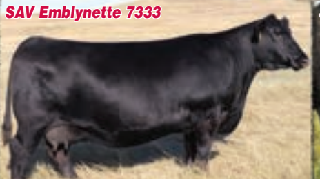
This fabulous fourth generation SAV embryo donor by Resource is the #1 IMF female of her calfcrop and records a weaning ratio of 106 on 4 calves, following the tradition of her Pathfinder dam by Right Time. Her grandson, SAV Stars N Stripes 2043, is featured.