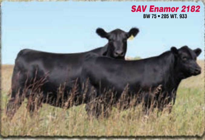
He sells! Encore x SAV Blackcap May 0519. A versatile outcross calving-ease bull with length, volume, style and natural good looks to sire the kind of feeder cattle that command a premium. His 2-year old dam by Raindance is a maternal sister to Jesse James and daughter of the powerhouse Pathfinder, SAV Blackcap May 8961.