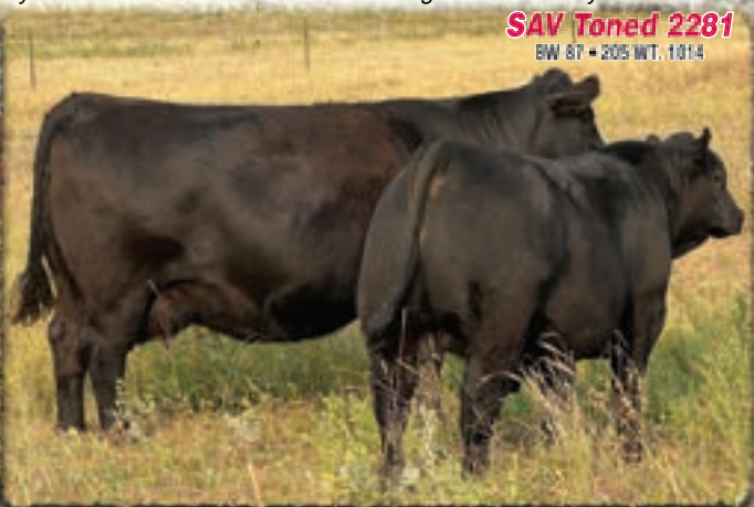
He sells! Territory x SAV Emblynette 8275. A rancher's bull with superior stoutness – ripped with muscle and thickness from front to back. He earned a 205-day weight of 1014 lbs. for a weaning ratio of 109. His moderate Charlo dam records a weaning ratio of 109 on 3 calves.