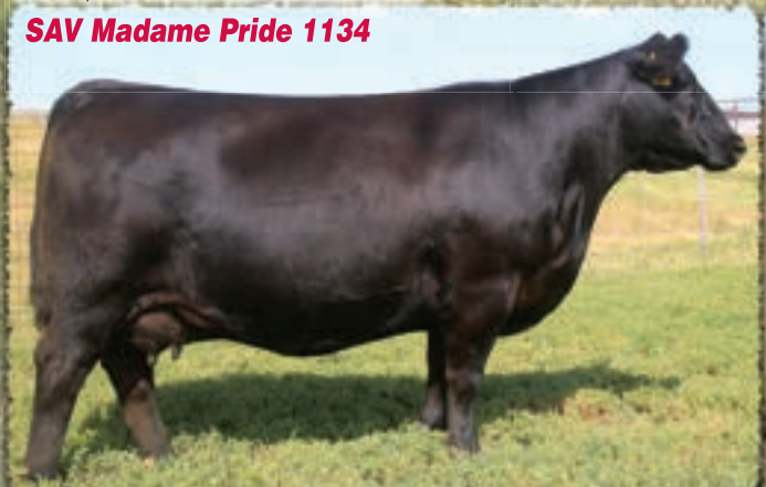
This phenomenal Pathfinder by Bismarck records a weaning ratio of 105 on 9 calves and has nine daughters working in the SAV herd and 58 progeny highlighting past SAV sales. She is the dam of the $260,000 SAV Ten Speed 3022 at Genex AI Stud. Her Downpour son, SAV Dominant 2901, is a special sale feature.