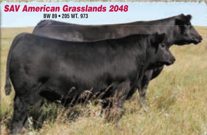
He sells! America x SAV Madame Pride 8051. A cowmen's bull with capacity, muscle and pounds in the right package. His moderate, nice-uddered Renown x Density dam records a weaning ratio of 104 on 3 calves and is a full sister to SAV Grasslands 5075.