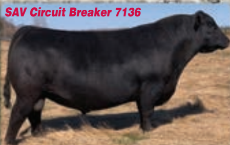
This massive performance herdsire is the top ribeye bull and third top-selling bull from the 2018 SAV Sale. He comes from the proven Pathfinder, SAV Madame Pride 3145. His progeny and maternal siblings sell.