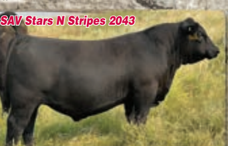
He sells! America x SAV Emblynette 9035. This photo taken prior to weaning depicts the masculinity, muscle definition and early maturity of this big-time herdsire prospect who has been a favorite from day one.