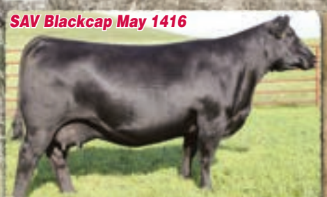
This front-pasture donor has a production record second to none with multiple herdsire sons, including the $275,000 SAV Scale House 0845, Expertise, Constitution and Ease. 15 progeny by Bloodline, Cattlemaster, Downpour and Scale Crusher sel!!!

He sells! Jesse James x SAV Blackcap May 4593. SAV Lonesome Dove 2039 is a real-world beef bull stamped with thickness, muscle, capacity and pounds. His powerhouse dam earned a weaning ratio of 106 on 7 calves and serves in the SAV embryo program. Her progeny include the $60,000 SAV Renew 8132 at ST Genetics and the $30,000 SAV Fullblood 1015, while four progeny by America and Bloodline will sell in this event.