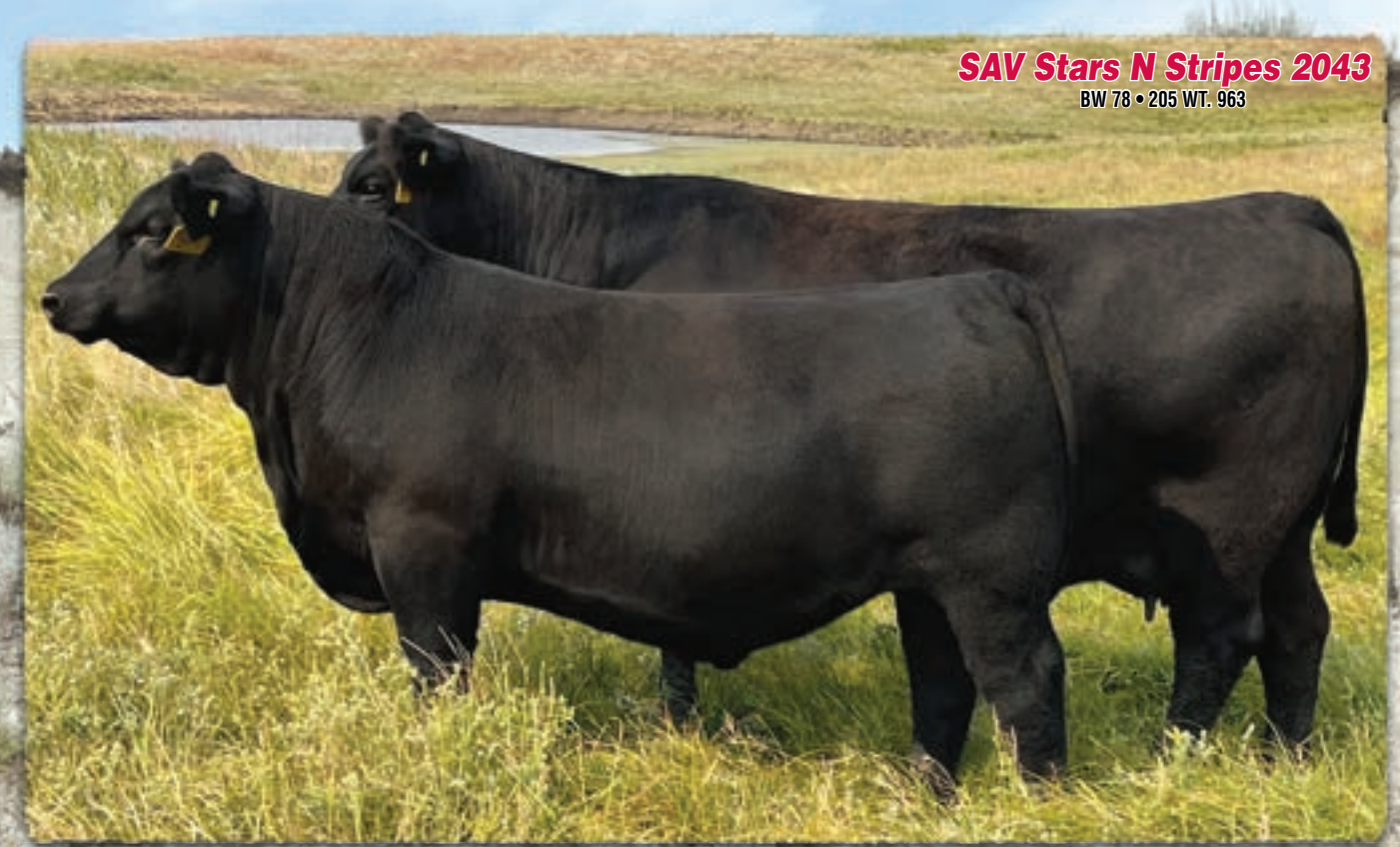
He sells! This America x SAV Emblynette 9035 is a personal favorite of his calfcrop with superior shape, structural integrity and authentic Angus breed character – the look of a breeding bull who will impact every calf he sires. He will be among the most important bulls to sell anywhere in 2023. His beautiful 3-year old dam represents everything we look for in an ideal cow. His grandam by Resource and Pathfinder third dam by Right Time have served in the SAV embryo program.