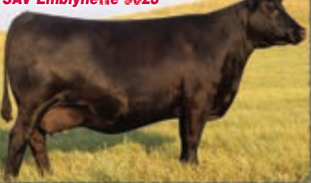
This beautiful 3-year old brood matron earned a weaning ratio of 108 on two calves and is the dam to the $345,000 SAV Magnum 1335 at ST Genetics. Her maternal sister by Bloodline and son by America sell!