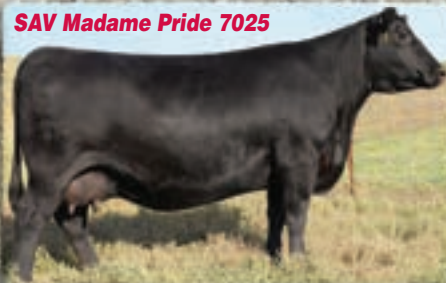
This one-of-a-kind brood matron by Charlo from the maternal matriarch SAV Madame Pride 0075 represents the best in old-school foundation genetics. Her son by Territory sells.