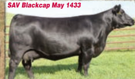
This herd icon hails from the same flush as Resource and has earned position among the best in the business. She records a weaning ratio of 104 on 9 calves and has nine progeny selling by America, Emblem and Bloodline.