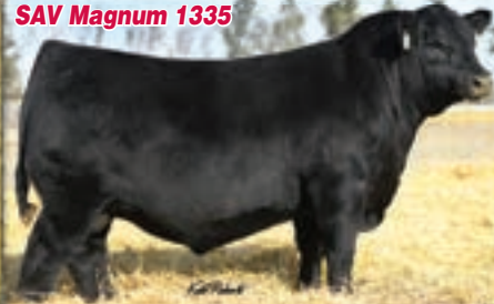
The $345,000 lead-off bull of the 2022 SAV Sale where he was the heaviest vearling weight bull and a multi-trait leader, selling to ST Genetics and Mohnen Angus. His service and a maternal brother by America is featured.