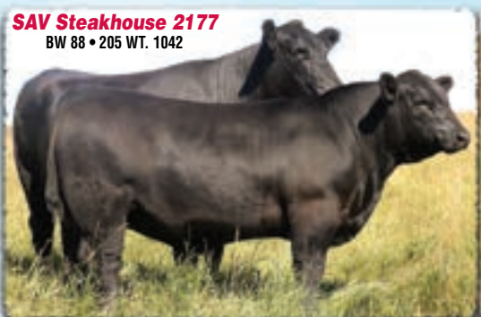
He sells! Represents the phenomenal first calfcrop by Scale House, the $275,000 top-selling bull from the 2021 SAV Sale. His Sensation x Rito 9969 x Net Worth dam comes from six consecutive generations of Emblynette Pathfinders.

Sires represented include America, Bloodline, Territory, Renovation, Jesse James, Scale House, Certified, Grand Canyon, Downpour, Rainfall, President, Density, Circuit Breaker, Anthem, Early Arrival, Ease, Pancho Villa, Landmark, North Face, Benchmark, Revolution, Scale Crusher, Rito 707, Ideal Encore and more. ✓ Volume selection ✓ Free delivery ✓ Affordable to the cowman