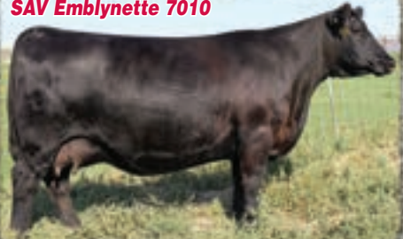
This new generation SAV embryo donor by Charlo x Resource is a model cow with ideal size, udder quality and foot structure. She sells as a special feature carrying a Jesse James heifer calf along with her son by Certified.