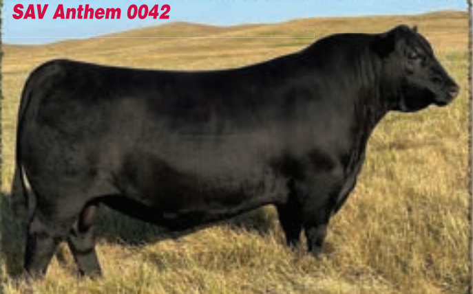
The $225,000 lead-off lot 1 bull from the 2021 SAV Sale to Voss Angus. This America son out of SAV Madame Pride 3145 represents all the qualities we look for in an ideal breeding bull and will have a big future ahead. His first progeny as well as full and maternal siblings are