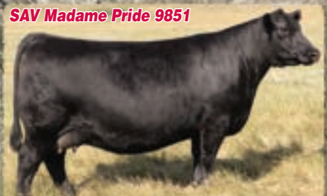
Eighth generation SAV embryo donor by President. 13 progeny by Bloodline, Certified and Territory sell.

A solid-to-the-ground President x 4407 daughter with moderation, muscle and maternal. A daughter by Scale House sells along with maternal siblings by Rainfall and Certified.