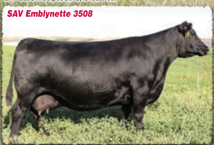
This 10-year old brood matron by Resource has assembled a superior production record with 12 daughters retained in the SAV herd and 37 progeny highlighting past SAV sales. Her son by Jesse James is featured.