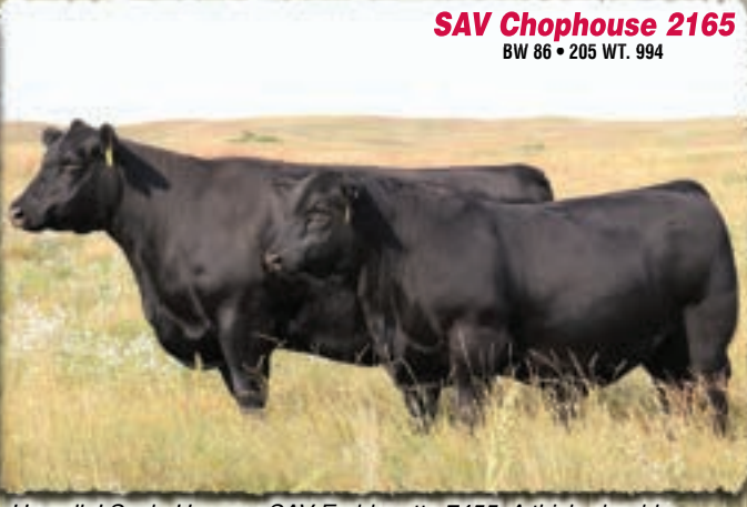
He sells! Scale House x SAV Emblynette 7455. A thick, durable, rugged-built bull with massive dimension and tons of muscle. He will add pounds and profit to every calf he sires. His dam by Seedstock x Resource x Bismarck is a model of efficiency from the Emblynette family that was established at SAV in 1942.