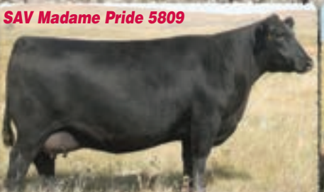
This front-pasture donor by International x SAV Madame Pride 0075 ranks among the best to ever walk SAV pastures. Five progeny by Revolution sell!