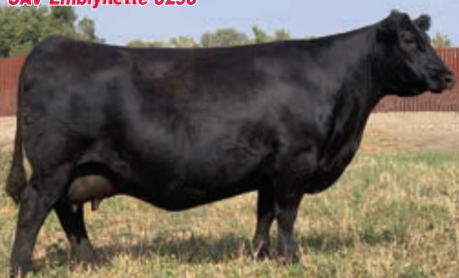
A major sale attraction! Unquestionably the single greatest proven herd matron ever offered in 120 productions sales held by the Schaff family. Known both as Density's all-time greatest daughter and the dam of the $230,000 SAV Territory 7225, she compiles a mile-long resume and can launch any program to a new level. She sells safe to Jesse James along with ten progeny by Bloodline, Certified, Scale House and Scale Crusher!